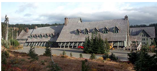
Drainage Improvements, Paradise Inn, Mt. Rainier National Park, Washington; Fletcher Farr Ayotte for the National Park Service