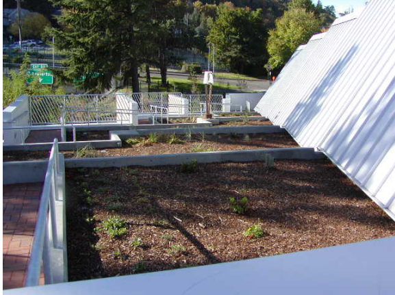
Innovative Stormwater Management, Native American Student and Community Center, Portland State University, Portland, Oregon; Stastny Brun