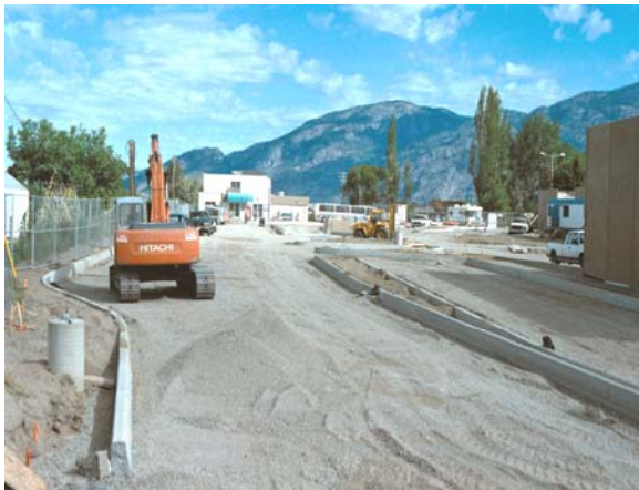
Hydraulic Analysis and Stormwater Plan, Oroville Shared Border Crossing, Oroville, Washington/Osoyoss, British Columbia