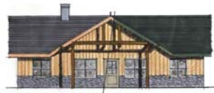
New Housing Development, Skokomish Indian Reservation, Washington