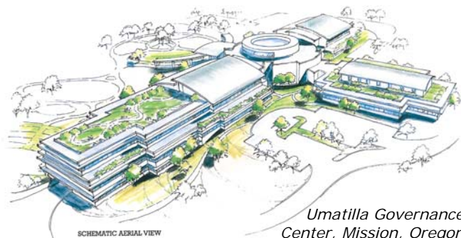
Umatilla Governance Center, Mission, Oregon