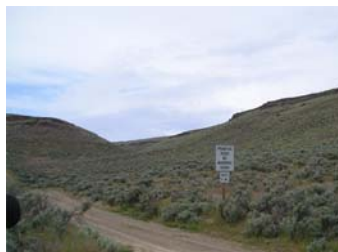
Wind Turbine Access Roads, 6 Sites in Klickitat and Benton Counties, Washington; NW Wind Partners