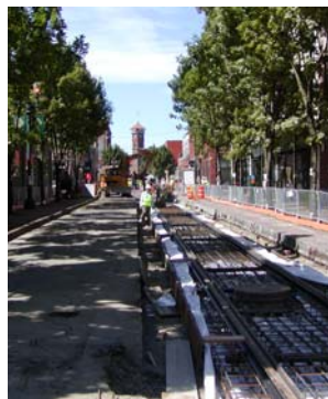
Portland Mall Revitalization Light Rail Project, Portland, Oregon; URS for Tri-Met