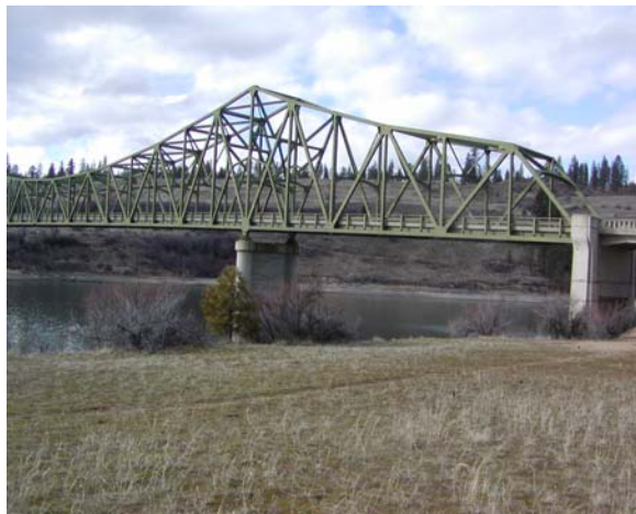
IRR Inventory, Transportation Improvement Program, and Transportation Plan Update, Spokane Reservation, Wellpinit, Washington