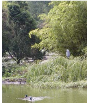
Laurelhurst Pond Sediment Management Project, City of Portland, Oregon